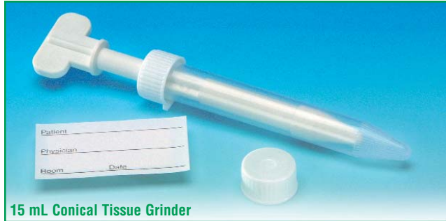
15 mL Conical Tissue Grinder

The 35 mL grinder is designed to be free-standing to allow for easier handling.